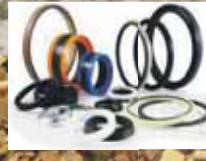
Stock Up on Seal Kits!