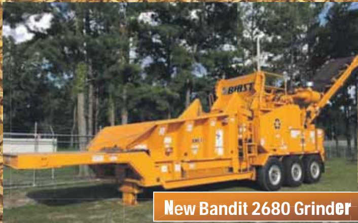
New Bandit 2680 Grinder