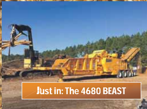
Just in: The 4680 BEAST

"Your Best Choice for Equipment & Parts!" www.qualityequipandparts.com or www.qmparts.com