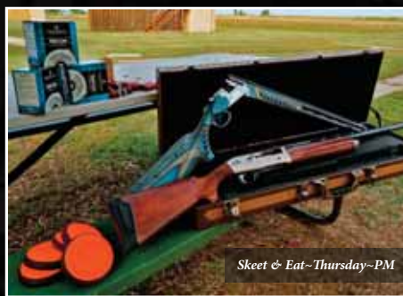
Skeet & Eat-Thursday-PM