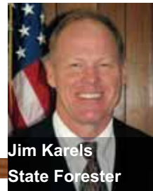
Jim Karels State Forester

To obtain an application form or to learn more about program requirements, contact a local Florida Forest Service county forester or visit the Cogongrass Treatment Cost-Share Program web page at FloridaForestService.com . All qualifying applications will be evaluated and ranked for approval.