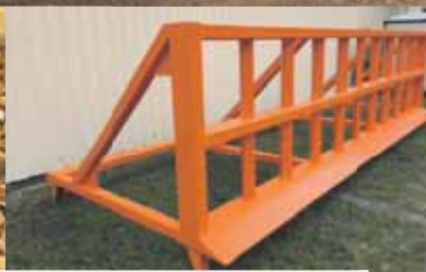
Free Standing Delimiting Gate!