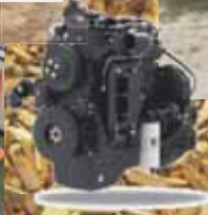
Cummins Engine Parts