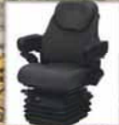
Skidder Seats Air Ride & Mechanical